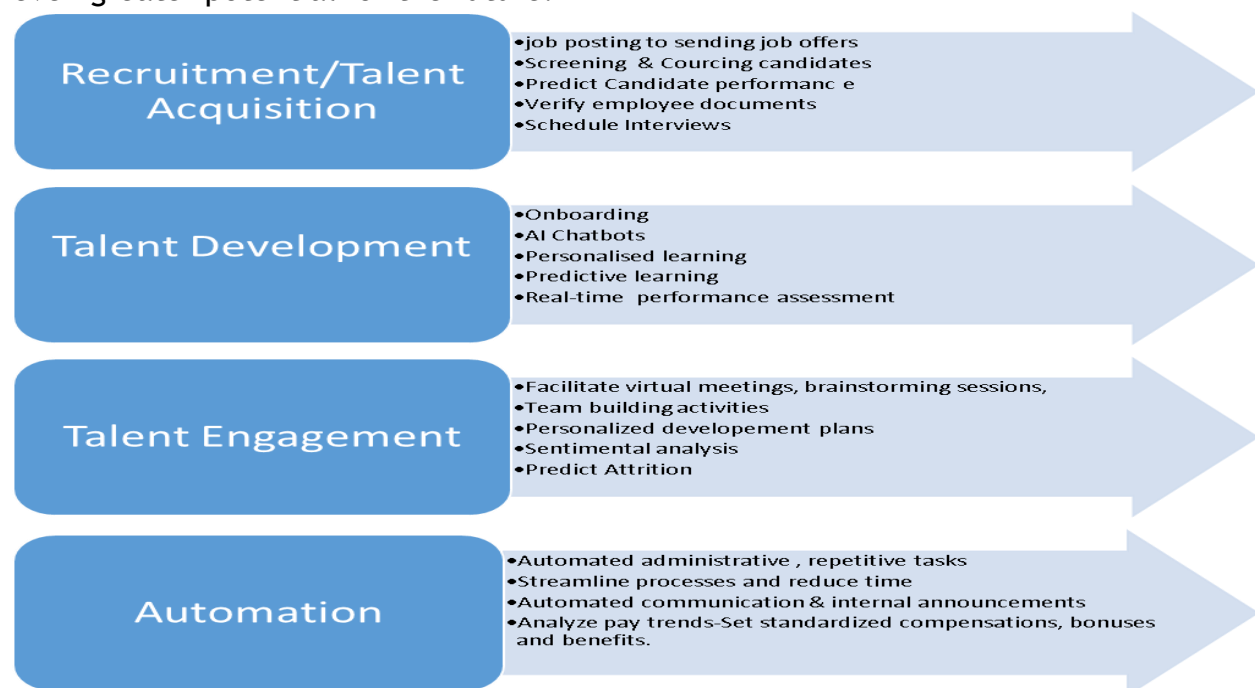
Fig(ii) :AI and HR Functions

Organizations are facing challenges when it comes to recruiting and retaining skilled employees, but there is hope on the horizon with the advent of AI technology. AI tools have the potential to provide much-needed support in various aspects of talent acquisition, growth, and retention for companies. By examining the transformative impact of AI from different angles, the author attempts to highlight how AI has already revolutionized human resources practices and holds even greater potential for the future.